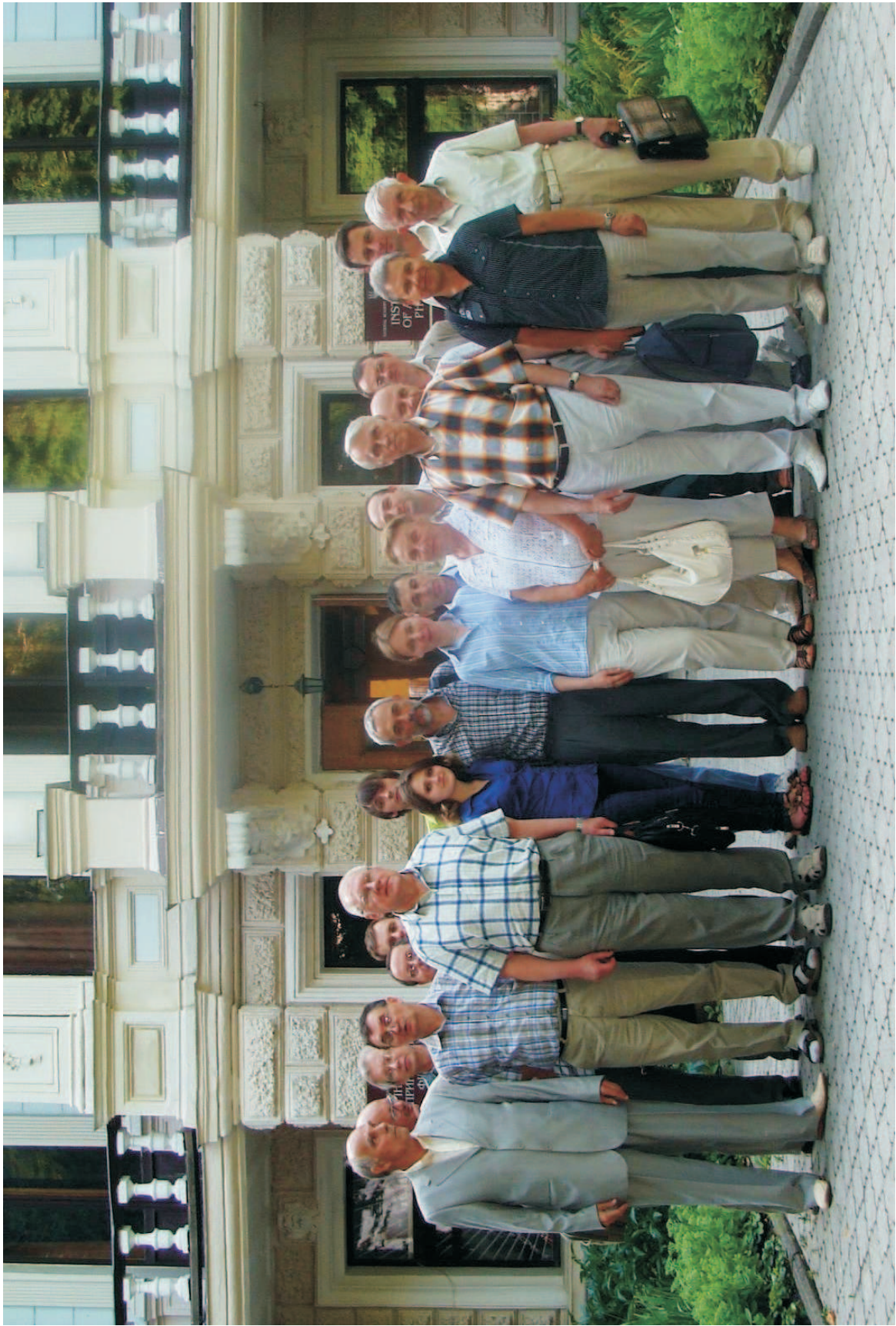
Workshop in memory of Petro Ivanovich Fomin, July 2, 2012