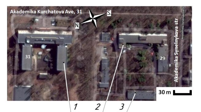
Fig. 2. The aerial view of the buildings involved in Proposition. 1 – Building of KhNU's School of Physics and Technology; 2 – Main building of Kharkiv Specialized Medical Unit № 13; 3 – Building for PET and patient care rooms

Our improvement in cancer treatment [4, 5] consists of the labeling of ethyl alcohol with <sup>11</sup>C isotope (i.e., the creation of a new radiopharmaceutical "Ethanol,<sup>11</sup>C" [3]), which enables PET imaging to visualize the location and spatial shape of the ethanol introduced into the tumor. The use of "Ethanol,<sup>11</sup>C" provides continuous dynamic control over the cancer treatment process with ethanol and the possibility of additional corrective injections of ethanol, if necessary.